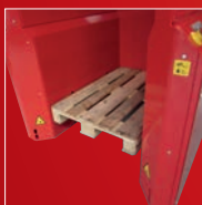
Reinforced inlet plates (+8 mm) + backplate (+1 mm)