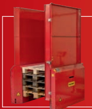
Safety frame with gate for 15 pallets