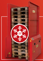
Pallet handling in cold environments down to -13 °F / -25 °C (Only available for 15 pallet / 500 kg capacity models)