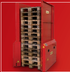
Safety frame for 15 pallets

The PALOMATs are built in 2 mm steel. Each unit includes safety frame, stop blocks, forklift protection, and a US plug.