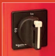
Main Isolation Switch